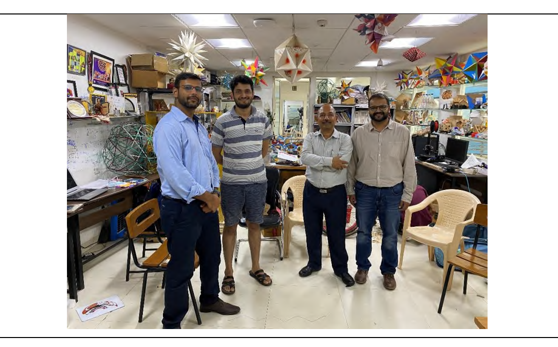
Skill Development Workshop on for promotion of Art & Culture