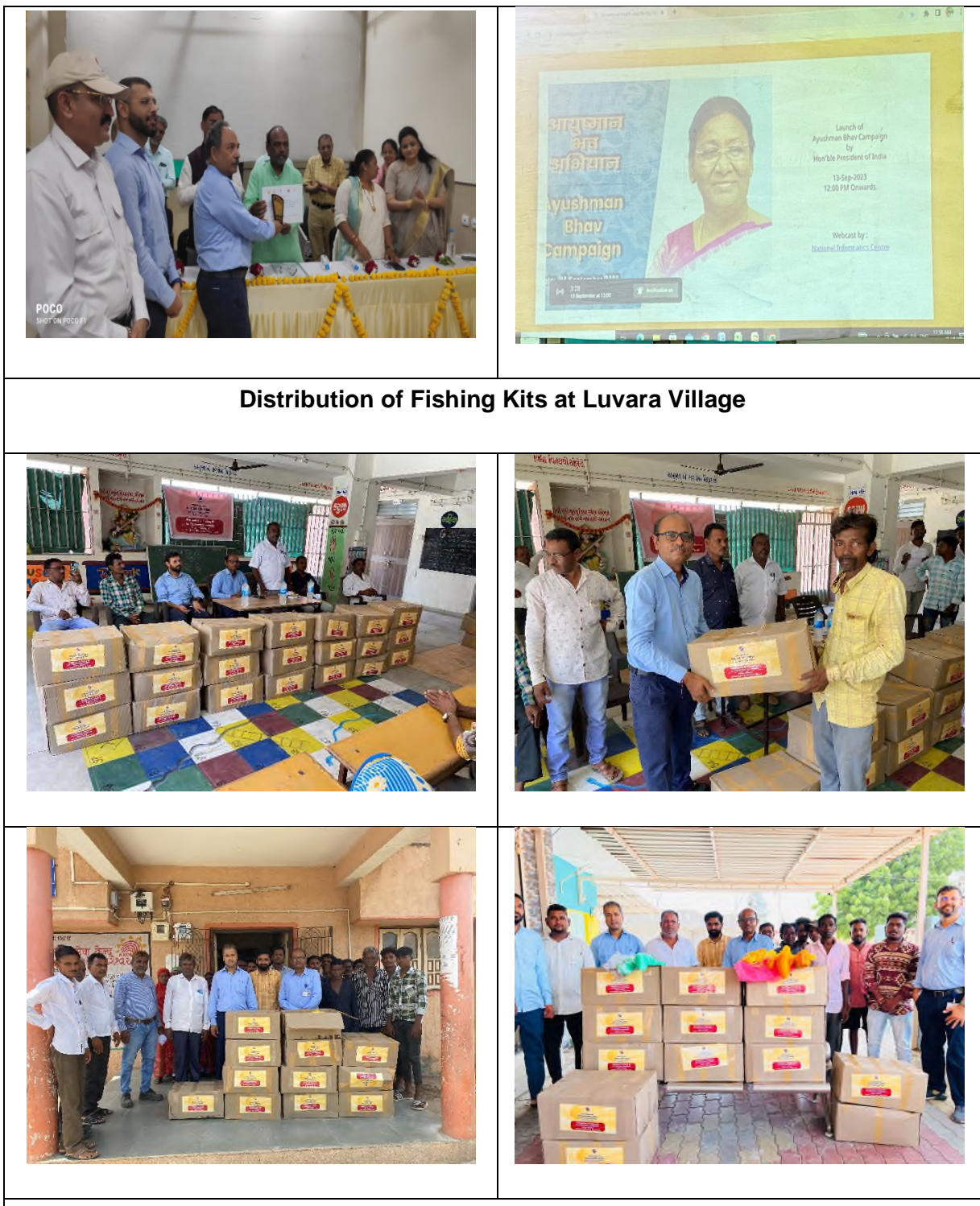
MoA for Construction of Govt. Primary School, Lakhigam Village