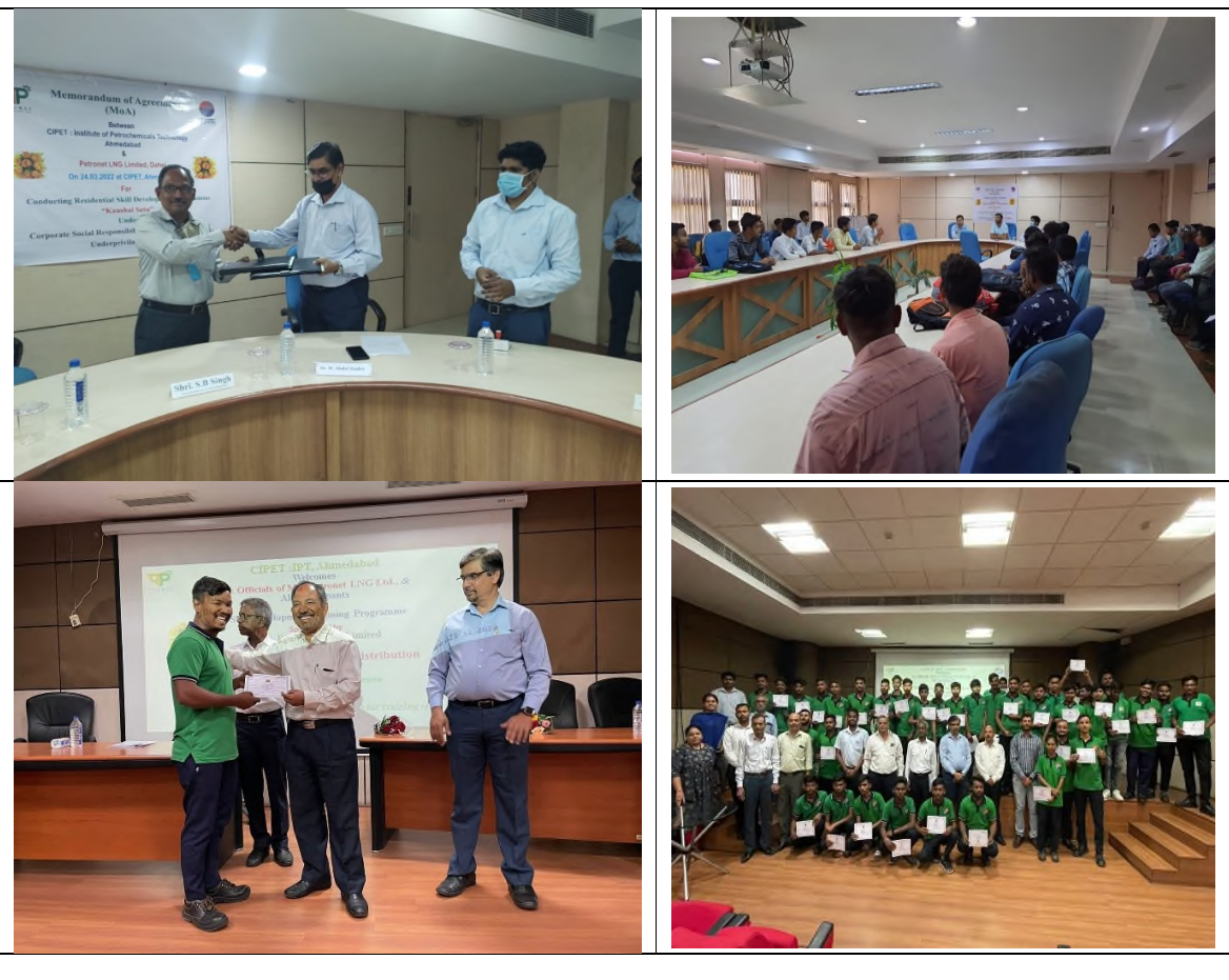
Mobile Health Unit (MHU) (Wockhardt Foundation)