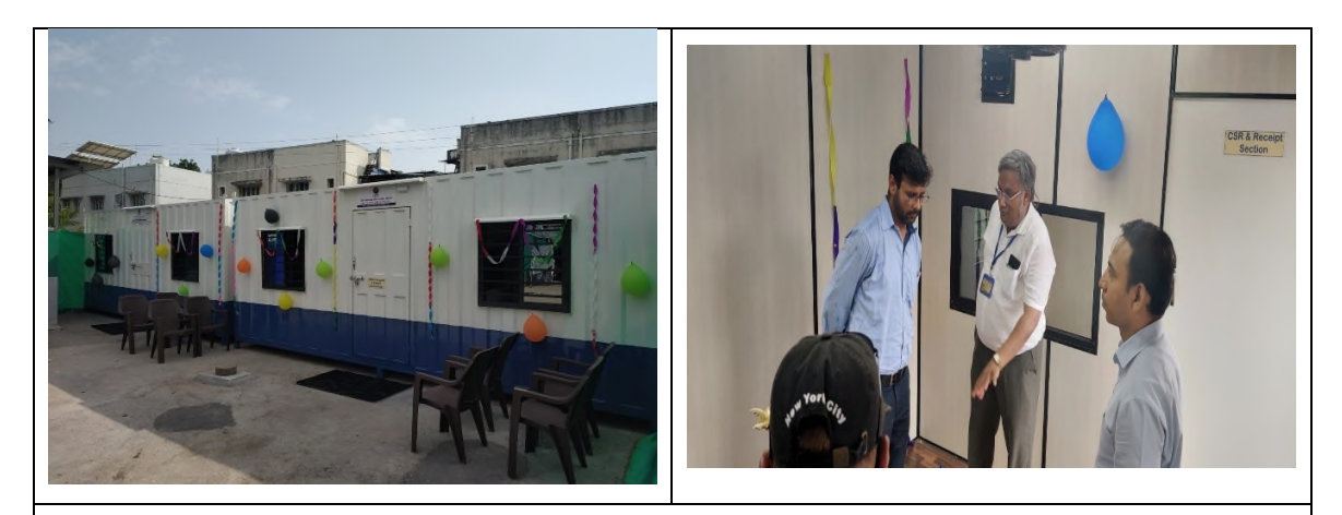
Visit of Ashmita Vikas Kendra, Tralsa