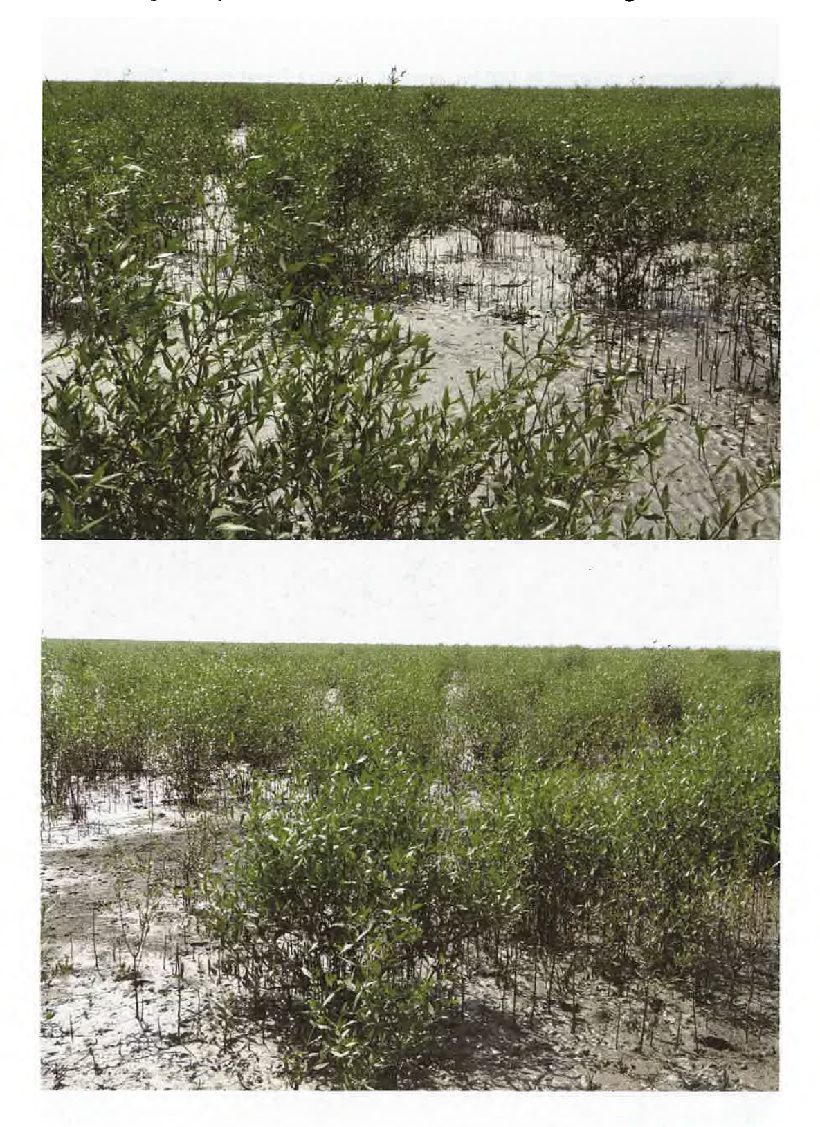
Mangroves planted in 50 ha. area at NADA Coast during 2009-10