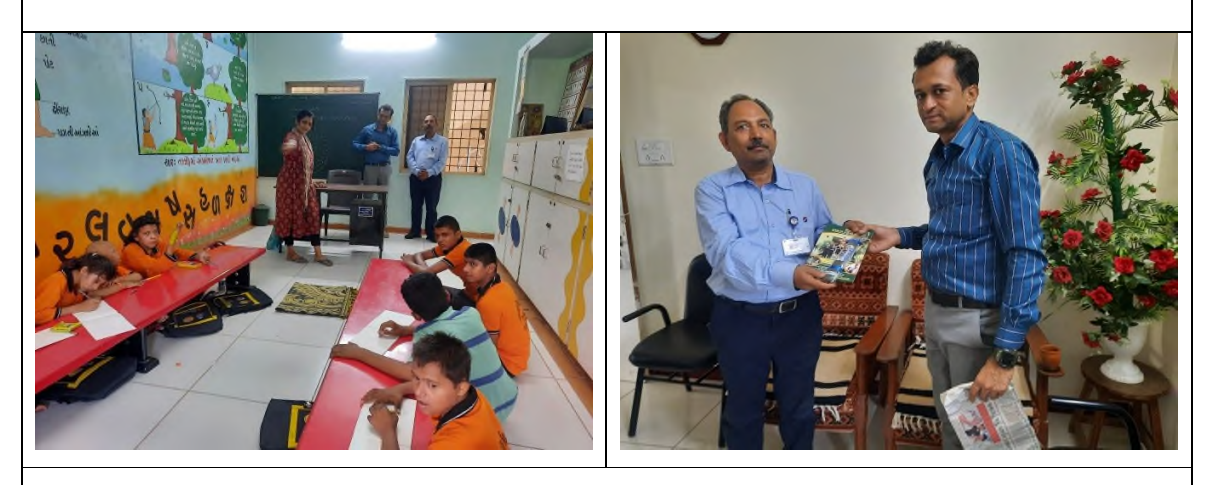
Construction of Panchayat Bhavan, Lakhigam