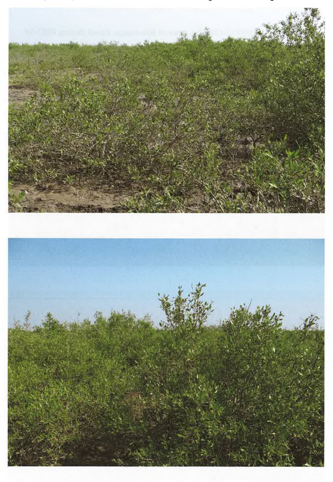
Mangroves planted in 100 ha. area at Bhavnagar Coast during 2012-13